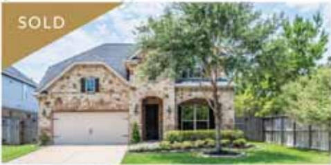
5302 LITTLE CREEK COURT | FULSHEAR, TX