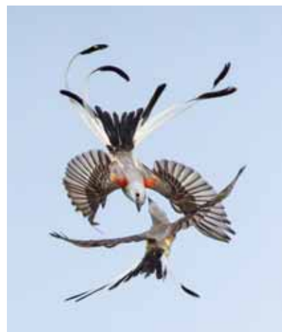
Scissor-tailed Flycatchers in courtship at Polishing Pond