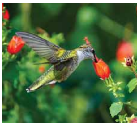
Ruby-throated Hummingbird feeding on native Turk's Cap flowers.

It is with great relief that we welcome Fall back to Southeast Texas, with the associated return to double digit temperatures. As the season changes, our scorched vegetation will hopefully get a chance for renewal. During these months, our skies are full of millions of birds migrating overhead, while our resident wildlife adapts to the changing of seasons. Finally, the slipping temperatures means that time spent out of doors becomes a much more enjoyable option around the neighborhood.