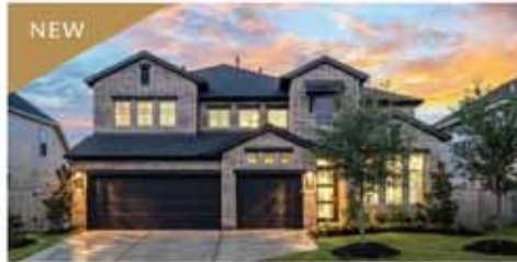
4207 ANA RIDGE LN | FULSHEAR, TX