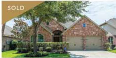
26315 CRYSTAL COVE LN | RICHMOND, TX