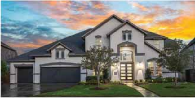
27927 STARLIGHT HARBOR LN | FULSHEAR, TX