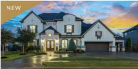
27911 STARLIGHT HARBOR LN | FULSHEAR, TX